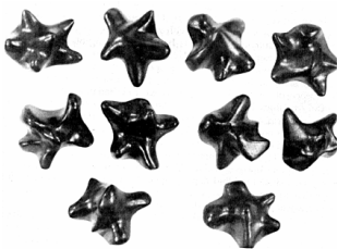
Figure 4 Gibson's active touch shapes [21, p. 124].

In interaction design, calm technologies [73] like Jeremijenko's Live Wire, which manifests the flow of Ethernet traffic through the twitching of a cable suspended from a ceiling, explicitly take on the task of producing physical cues that can be tacitly understood. The Live Wire is designed for visual tacit knowledge; the next section explores manual tacit knowledge.