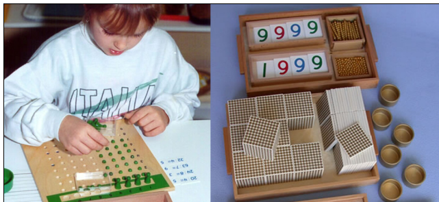
Figure 1 With Montessori blocks, concepts such as distinct numbers are represented through distinct physical sizes, shapes, and colors.

Just as moving about in the world helps infants to learn about the physics of the world and consequences of actions,