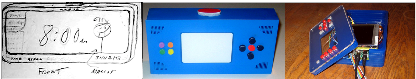
Figure 3 A paper sketch, physical mock-up, and final prototype, showing how the interface of SnuzieQ, an alarm clock, evolved through prototyping.

When compared to other human operated machinery (such as the automobile), today’s computer systems make