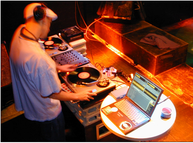
Figure 8 Final Scratch: encoded vinyl for digital music.

sensory richness or the nuance of manipulation offered by the “real thing.”