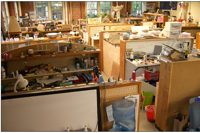
Figure 6 The Stanford Product Design loft studios.

over prolonged use. Physical feedback can further help to distinguish commands kinesthetically.