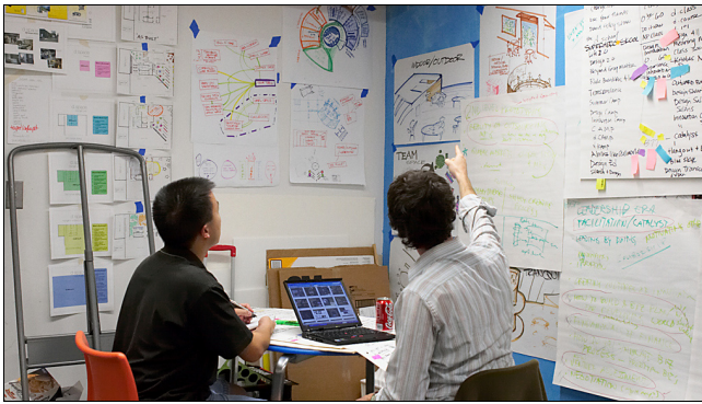
Figure 7 Butcher paper lines the wall of the Stanford d.school meeting room.

The visibility provided through collocated practice with task-specific artifacts is also successful in supporting synchronous collaboration, and can be especially useful in mission-critical systems. Mackay's air traffic control studies [41] focused on the role of the paper flight strips that provide a hand-scale physical representation of airplanes. Her primary finding was that controllers coordinate the management of air traffic by coordinating the management of flight strips . As we are much less likely to ignore a colleague who presents a request by walking into our office than by sending an email (partially because "receipt" of the request is much more visible), Mackay found the physical act of handing a strip to have important properties not easily replicated in electronic systems. The social life of physical artifacts and their visibility facilitate distributing the cognitive work of groups (e.g., [26, 29]).